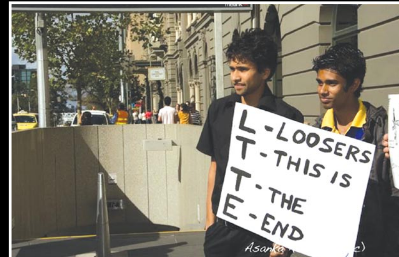
Atleast on the boards the LTTE was written off