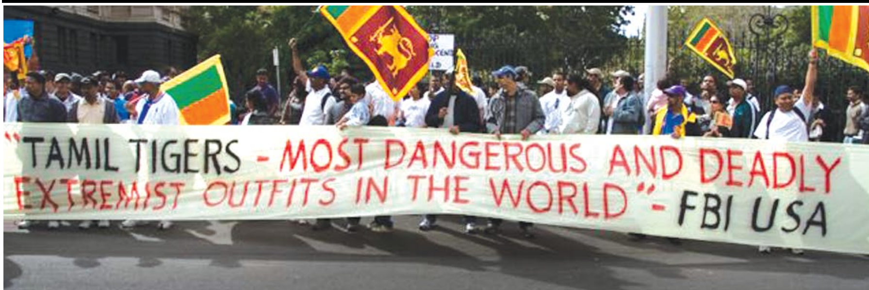
Sri Lankans finally seem to have found their voices