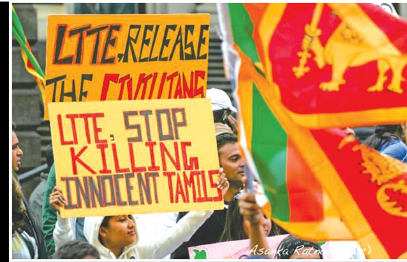
The LTTE got a dose of its own medicine