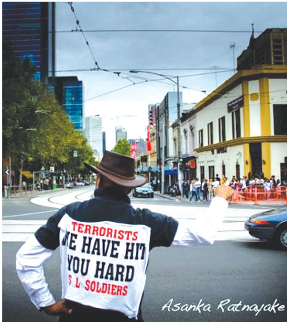
Protesters in Melbourne

While pro LTTE demonstrations lamenting the ill treatment of Tamils by the 'Sinhala