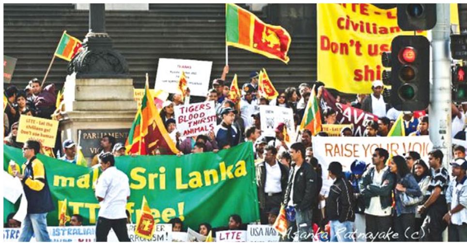
The protest was one of the biggest by the Sinhala diaspora

And while it has taken 25 years, from the size, visibility and ultimately peaceful nature of the demonstration it appears that the Sinhala Lion has finally learned to roar.