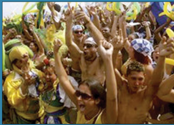
Crowds on Copacabana beach in Rio were jubilant after the result

President Lula said 2016 was an opportunity for the IOC to show that the Games belonged to people of all continents. "I truly believe this is Brazil's time. For the others, it would be just another Games," he added.