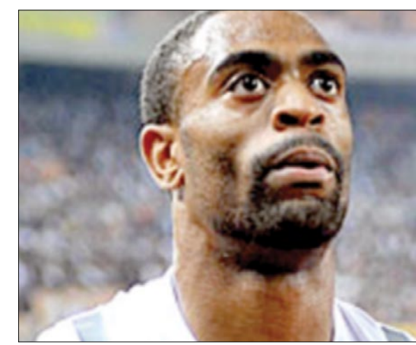
Tyson is to have surgery on his groin in the close season

Also in Daegu, venue for the 2011 World Championships, Carmelita Jeter of the United States won the women's 100m in 10.83 seconds.