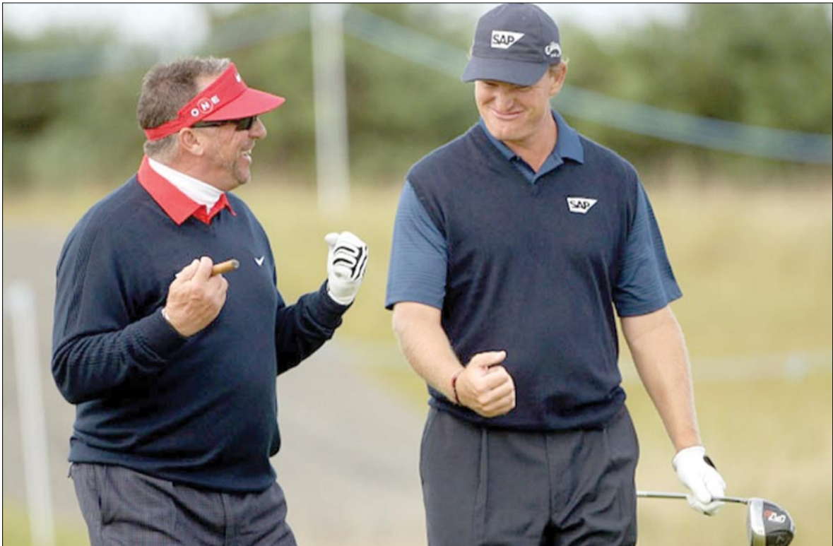
Sir Ian Botham and Ernie Els share a joyous moment during their round at the Dunhill Links PGA European Tour - Alfred Dunhill Links Championship 2009 - St Andrews, Carnoustie & Kingsbarns