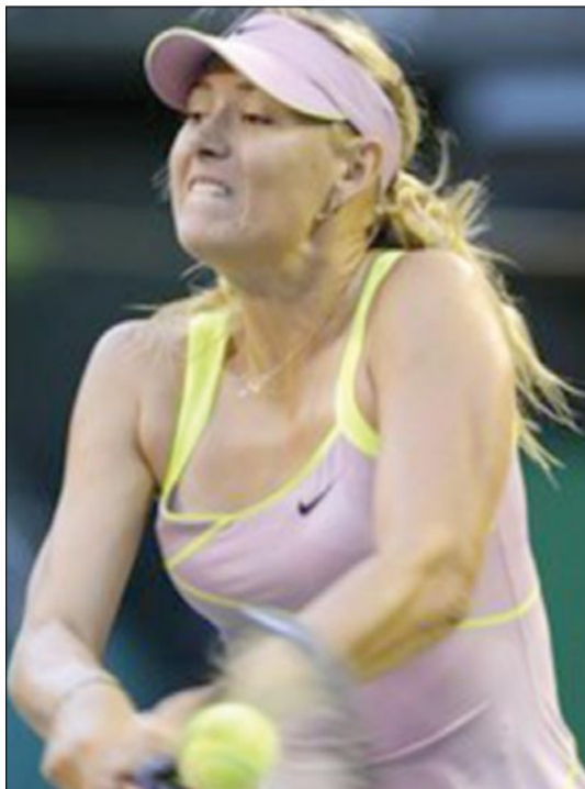
Sharapova has a good record at the Tokyo tournament